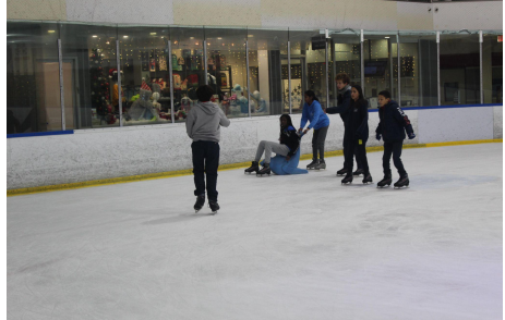
We finally made our class trip come true. The Skate day had been planned for months with many interruptions and challenges BUT we finally made it.