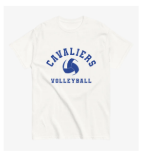
San Diego Academy CLASSIC TEE